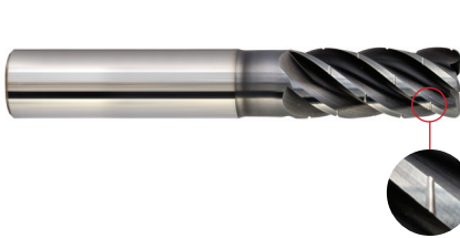
Close up of chipbreaker grind